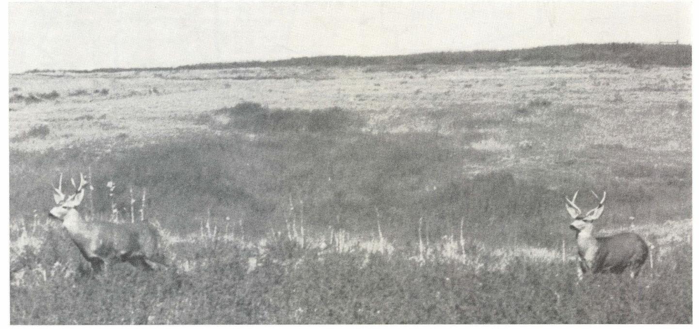
A pair of fine buck mule deer, their antlers shining in an early-morning sun, race across a draw in a Northwest Kansas pasture. They'll be targets for Kansas hunters in the state's third firearms deer season, December 8-12.

The deer-management-unit concept currently utilizing a system of limited permits based on a knowledge of the deer population and local conditions within each unit, appears best suited for Kansas. Generally, management units comprise one or more major drainages and/or ecological areas such as the "Chautauqua Hills" and the "Missouri River Bluffs." Within